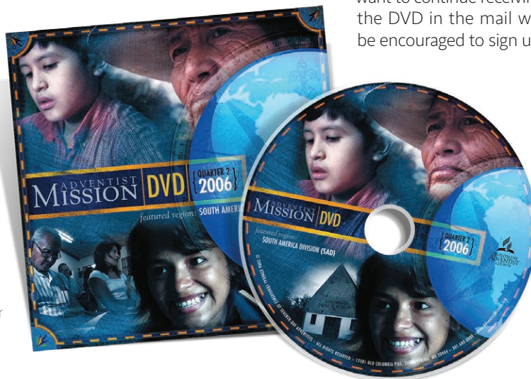
The first Adventist Mission DVD, second quarter 2006.

Adventist Mission also produces the Mission 360° TV program, shown on the Hope Channel, and Global Mission Snapshots , shown on 3ABN. These videos may also be viewed or downloaded at AdventistMission.org/videos .