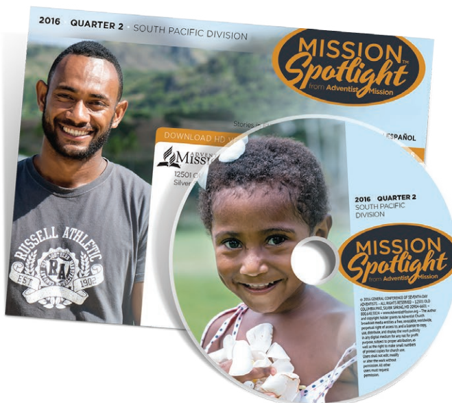
The Adventist Mission DVD, second quarter 2016.