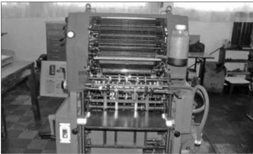
Ethiopian Advent Press equipment

For information on other Thirteenth Sabbath projects that have been completed, thanks to your generous offerings, go to www.AdventistMission.org .