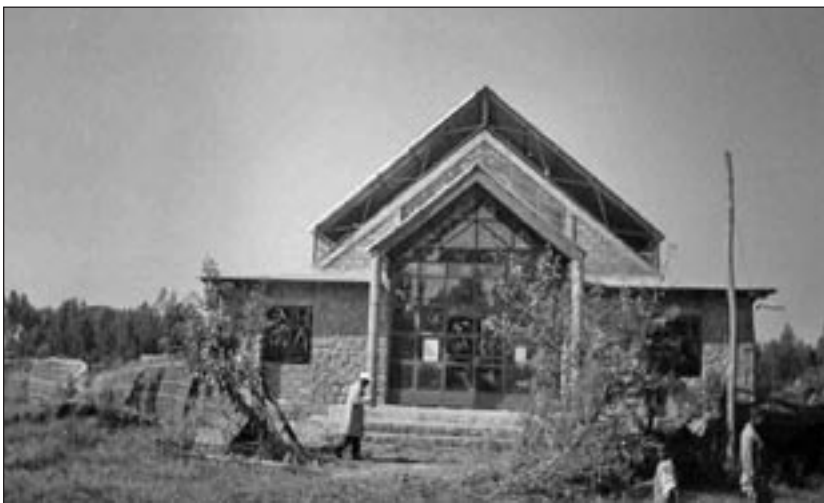
Bahirdar, Ethiopia, church