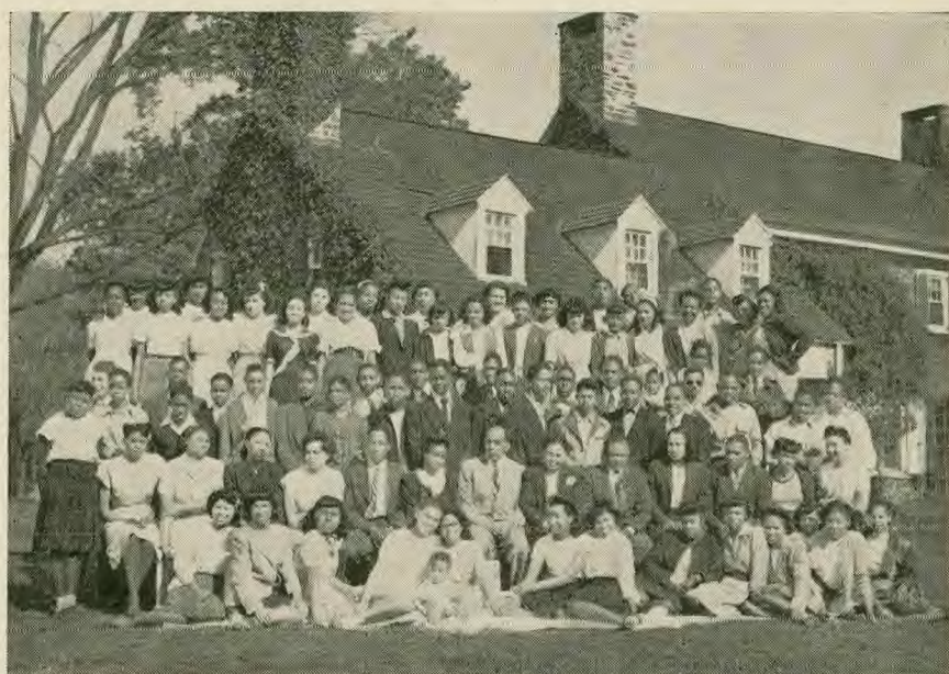
Partial Faculty and Student Body

The good will of the community was finally incurred after much opposition to our purchasing and occupying the property for our school site. One wealthy doctor, of whom the school knew nothing, died, and left in his will a portion of his estate to the Pine Forge Institute. A neighbor approached the principal one day and slipped into his hand a neat cash sum in appreciation for the work of our school in his community. The Elks Club of Reading, Pennsylvania, sent a check for $125 toward our Ingathering drive after being contacted by one of our teachers. A well-to-do automobile dealer in the city of Pottstown gave a substantial down payment on a Victor motion-picture projector for the school. A mixed delegation from the Y.M.C.A. arranged for a banquet, a picture, and an after-dinner program to help celebrate the inaugural anniversary of the Pine Forge Institute and to obtain the good favor of