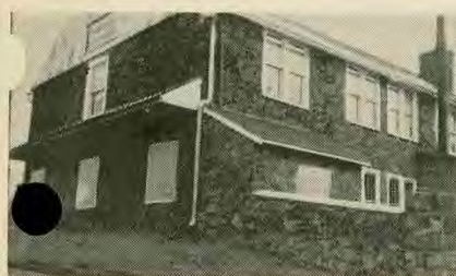
North Hall - Cafeteria Girls' Annex