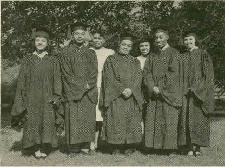
First Graduating Class, Pine Forge Institute