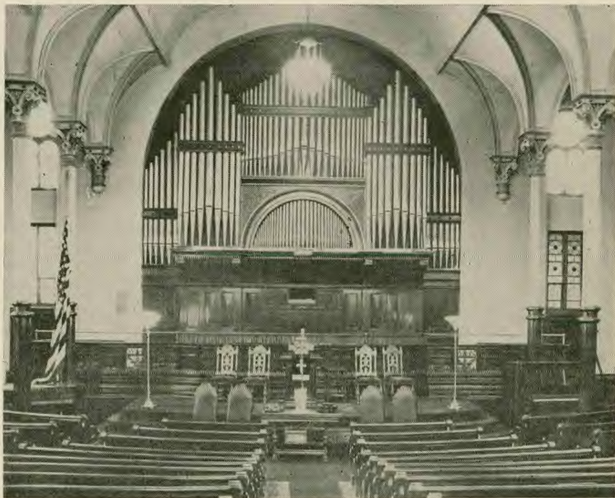
Bethel Church, Brooklyn, N. Y.