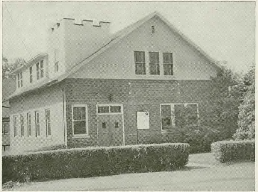
Recently Dedicated White Plains Church, White Plains, New York

Soon afterward oak pews were installed, pulpit furniture was purchased, a modern automatic heating plant for both parsonage and church was put in, and the basement of the church was completely renovated. This made room for the children's Sabbath school department and