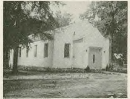
Newly Erected Bainbridge, Georgia, Church, Dedicated, May 26, 1948

"God has truly blessed us since coming to North Carolina. Not only have we held a very fruitful effort, but we have completely renovated our church. The minister's study has been redecorated and equipped with the most modern furniture. We have also put in a door chime and an electric signal for entrance into the study. A small gas heating device has also been installed, and two