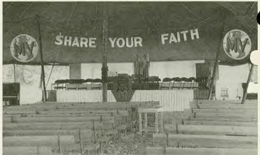
"Share Your Faith" Pavilion Where Congress Was Held