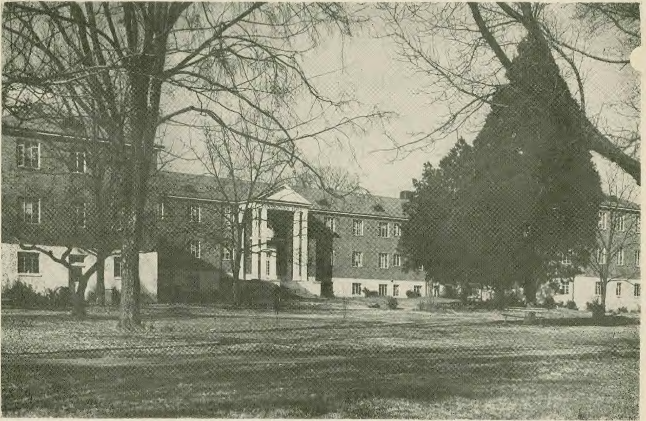
Cunningham Hall, Girls' Home