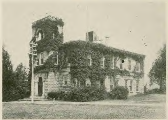
The first Administration Building, built in 1907

findings and how each man felt when he entered the gate of this plantation. Each one was impressed that this was the place.