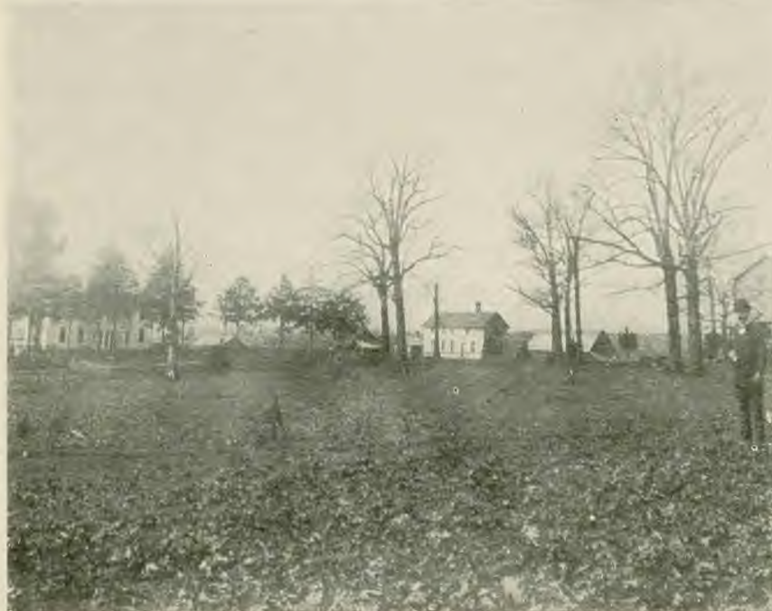
Oakwood Training School as it looked in 1896 when it was purchased

The name of this haven of Christian learning is a memorial in the hearts of her children and friends, who ever determine that Oakwood shall grow only in that purpose for which she was founded, and that she shall continue to be a sweeping finger of light in this shadowy age, pointing the hearts and souls of Negro youth to the stars.