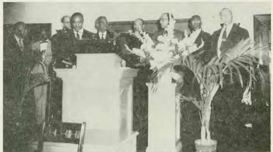
Dedication of Cincinnati Shiloh Seventh-day Adventist church.

The newly decorated Shiloh Seventh-day Adventist church recently was the scene of a three-day dedicatory service. It was a time of great rejoicing, and included the burning of the mortgage and an inspiring evangelistic sermon,