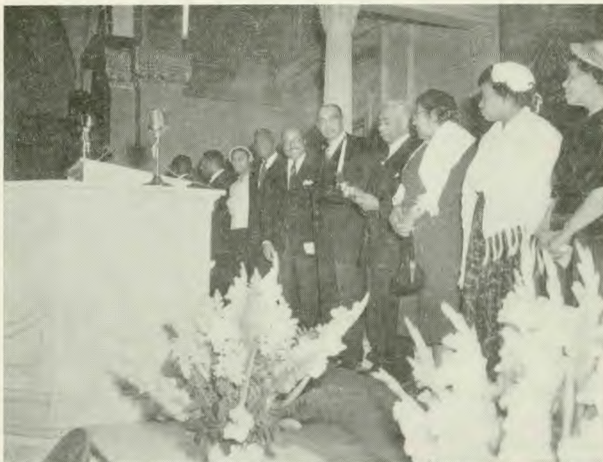
Mortgage-burning ceremony of Berea Temple church, Baltimore, Maryland, January 28, 1956.