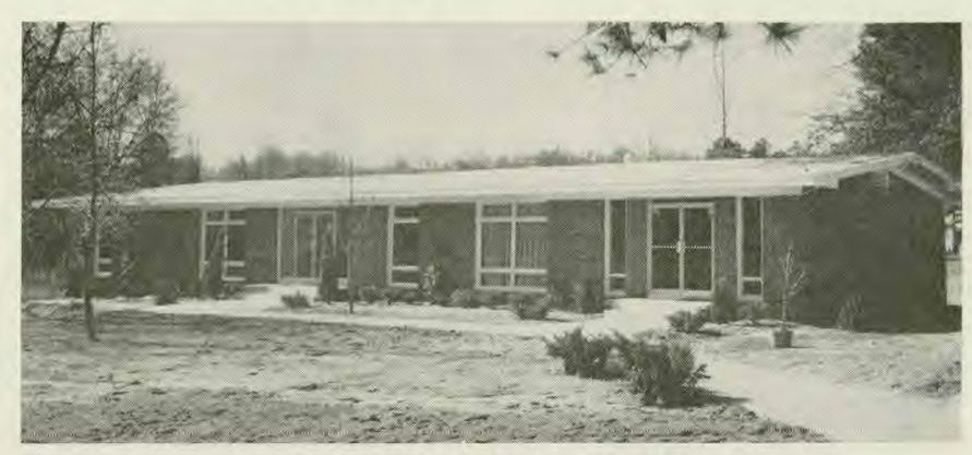
New office building for the South Atlantic Conference.

The Castle Street Seventh-day Adventist church is on the principal street of the city, and, under God, has entirely changed the popular conception of Seventh-day Adventists in that community. The congre-