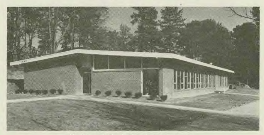
New Berean Junior Academy in Atlanta, Georgia.

gation and the community are proud of it. The church was built at a cost of sixty thousand dollars, but it is appraised at well over one hundred thousand.