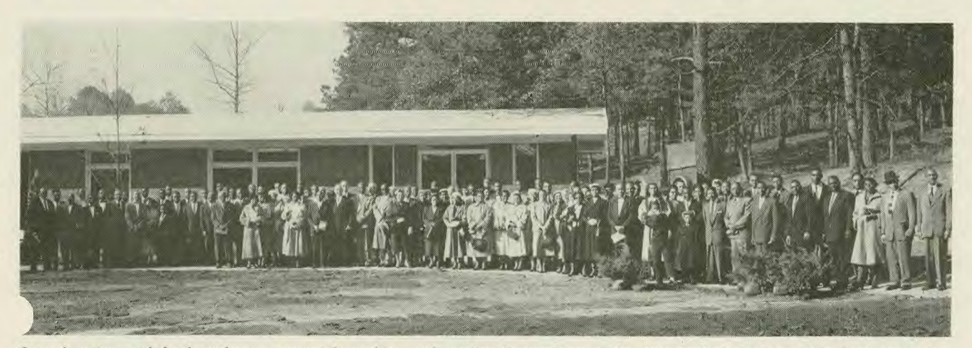
General, union, and local conference personnel, workers, and teachers in attendance at the joint workers' meeting and teachers' conventions.

The convention was held in the new school building of the Berean Junior Academy. This well-designed and well-constructed six-classroom unit has been a dream of the Atlanta church and school for some time. Now it has become a reality. We believe that the influence of the meeting in this building will be seen in new buildings and improved facilities in some other schools where changes are needed in the physical plant. The success