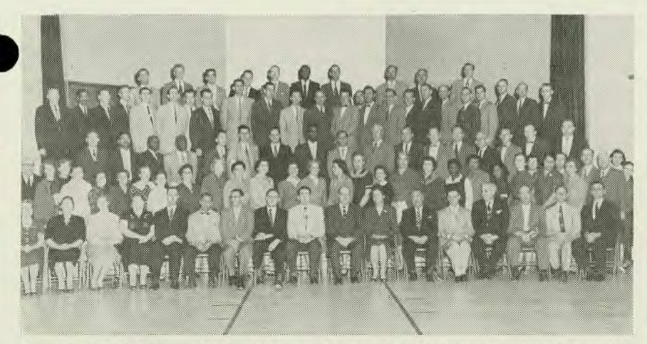
Secondary school teachers of Columbia Union Conference at convention in Takoma Park, Md.

ence, Pine Forge Institute in the Allegheny Conference, Plainfield Academy in the New Jersey Conference, and Takoma Academy and Shenandoah Academy in the Potomac Conference. The intermediate schools were represented by forty-nine teachers.