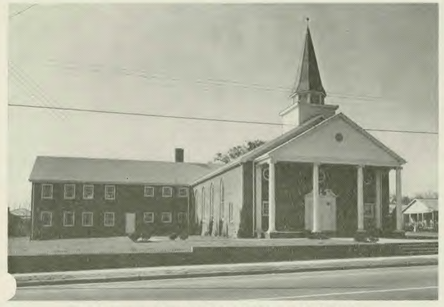
Newly constructed church building in Wilmington, North Carolina.

Much of the work was done by craftsmen of the church. The school is now valued at $65,000. It is built on a corner lot in a most desirable section of town. The lot was purchased during the pastorate of Elder J. E. Cox, Jr., and construction was