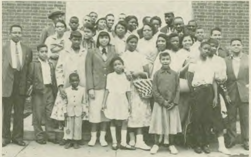
Group of Minute Men from the Bronx church standing in front of Independence Hall in Philadelphia, while on a tour to that city.

In mentioning some of our smaller churches, Ellenville with a membership of 26 raised $450. These faith-