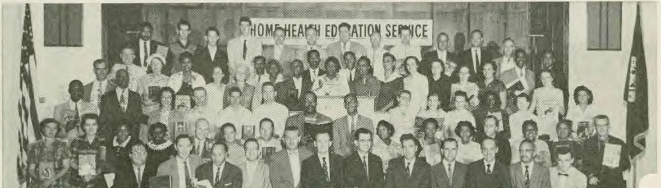
Literature evangelists in attendance at the quarterly training school, held at the Review and Herald Publishing Association, Washington, D.C.

One addition and one replacement have been made on the fac-