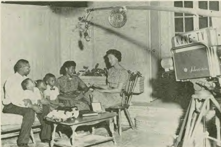
The Siwundhlas being interviewed on one of Wichita's TV programs.