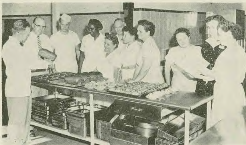
Food directors at Blue Mountain Academy.

The Manatwny summer camp, sponsored by the Allegheny Conference of Seventh-day Adventists, had the largest enrollment in its history, the director said. One hundred sixty boys and girls were enrolled.