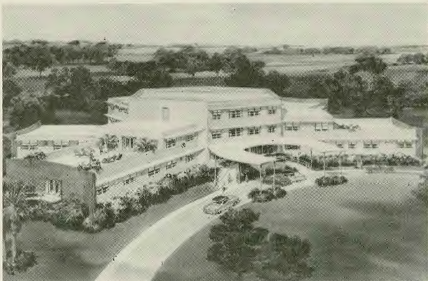
The new Dr. P. Phillips Memorial Hospital for Negroes in Orlando, Florida.

Early reports on South Atlantic's summer evangelism are good. The