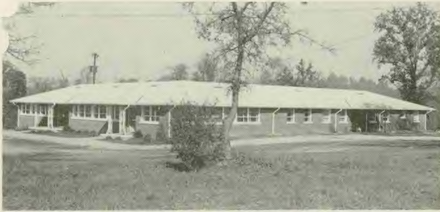
New office building of the South Central Conference.