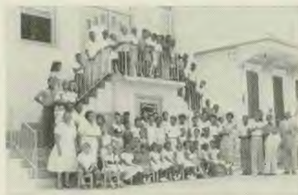
Part of group that attended Vacation Bible School in New Orleans, Louisiana.