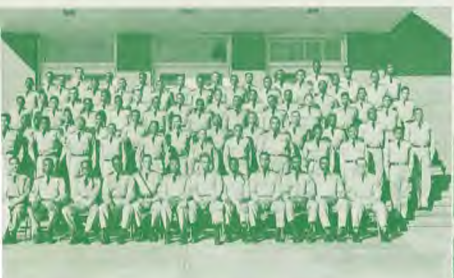
Medical Cadet Corps