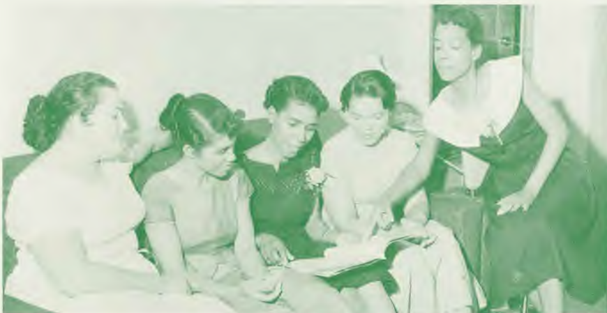
Officers of the Washington, D.C., Chapter meet.