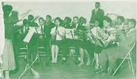
The college band