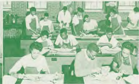
Dissection in biology lab.