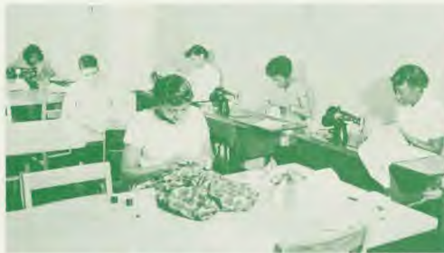
Clothing lab. in session