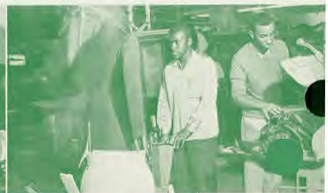
Pressing at dry cleaning plant