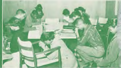
Prayer at "Power Hour"