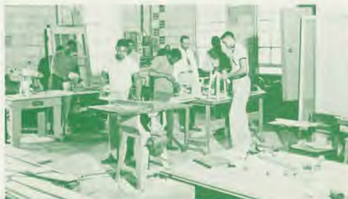
Industrial arts class at work