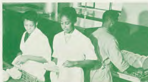
At work in the college cafeteria