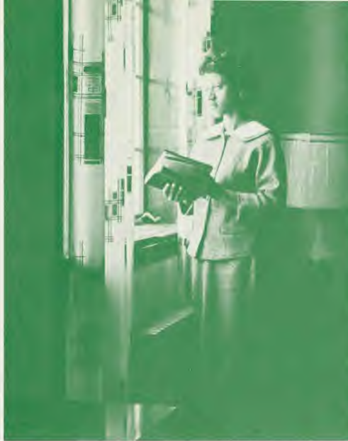
"In the morning I see His face"