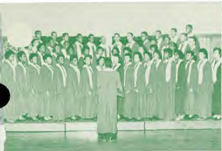
The college choir