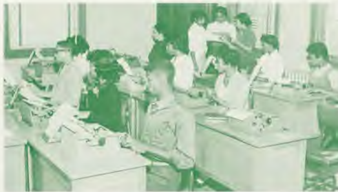
Perfecting typing skills