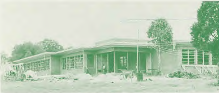
Elementary school goes up.