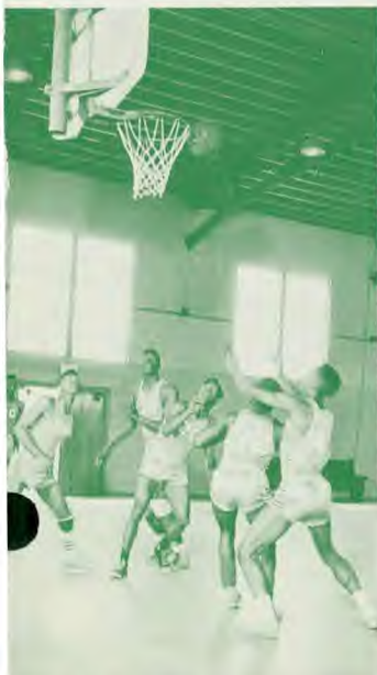
Basketball is the sport

Good sportsmanship and personality development