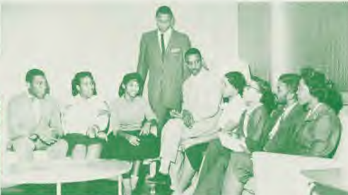
MV Society officers meet