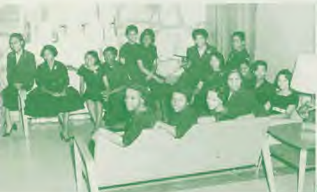
Gamma Sigma Kappas