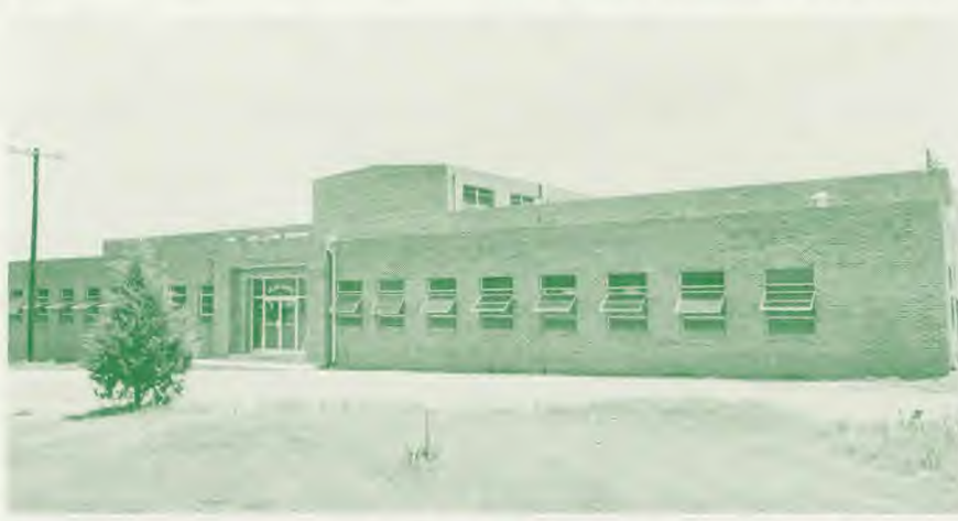
New college laundry now complete and equipped with most modern machinery for efficient service.