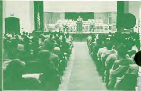
Week of Prayer vespers