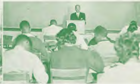
Religion class lecture