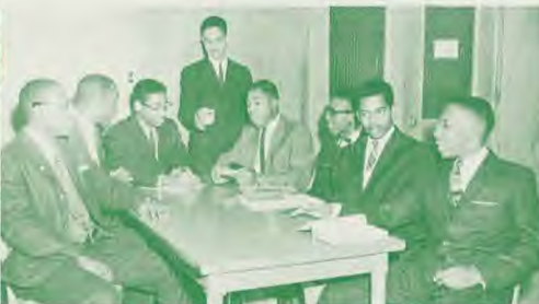
Excelsior Society makes plans