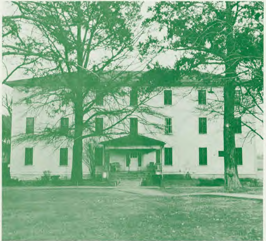
Henderson Hall now condemned.