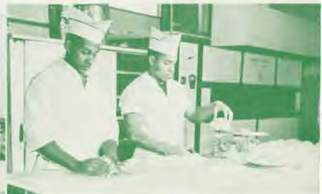
Busy hands in the bakery