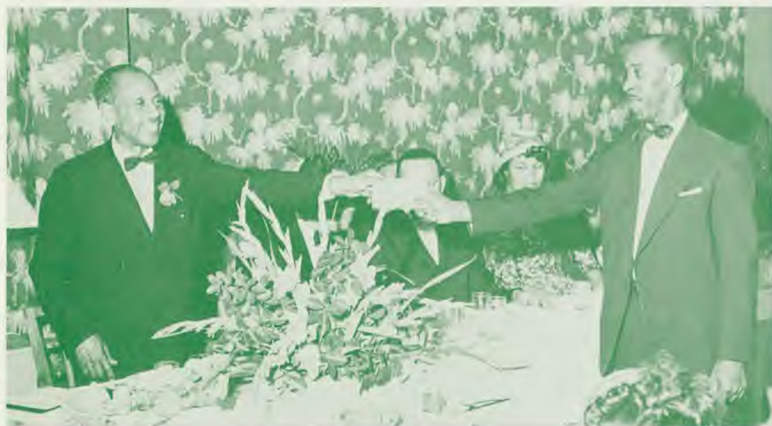
Atlanta Chapter has membership-drive banquet.

Success and Godspeed to a noble, progressive minister of the gospel.