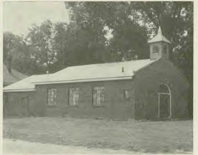
Temple Gate Seventh-day Adventist church of Selma, Alabama.