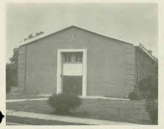
Bethany Seventh-day Adventist church of Montgomery, Alabama.