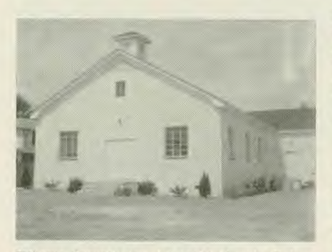
Ephesus Seventh-day Adventist church, Columbia, South Carolina,