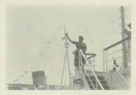
Lois Raymond waving good-by as she sails to West Africa.