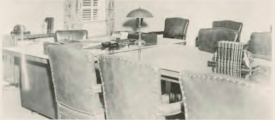
Conference president's office and committee room.