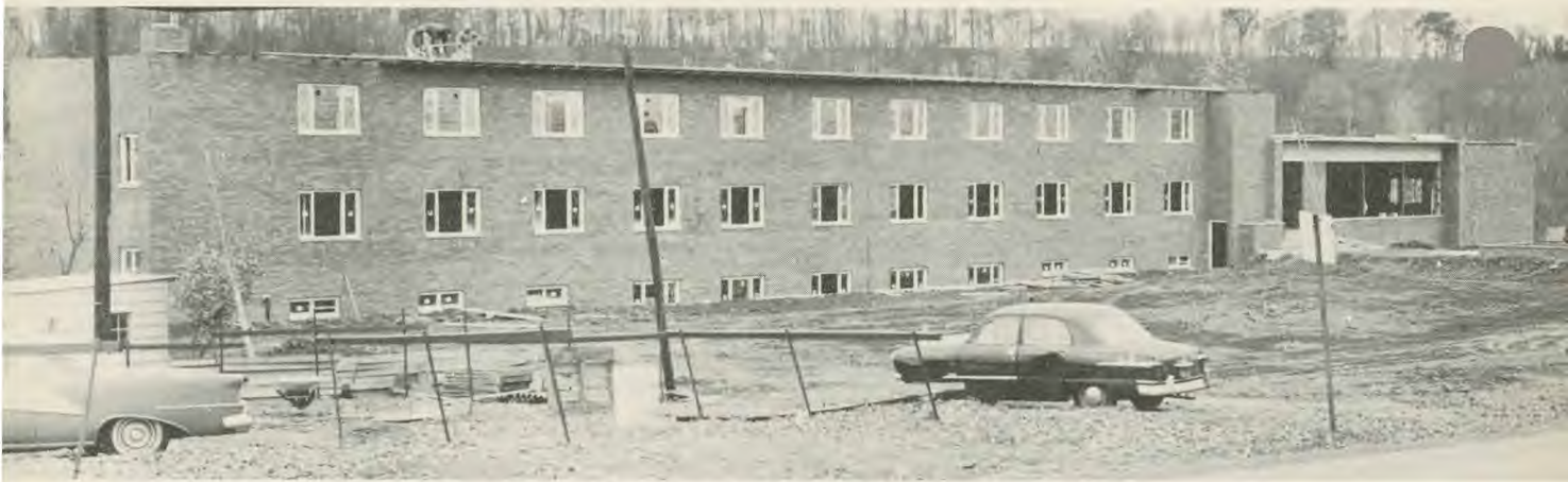
Girls' dormitory ready for roof, November 13, 1961.