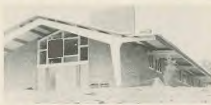
Dale Wright Memorial SDA church in Germantown, Ohio. Building is ultramodern, valued at $85,000. Constructed by Wright family and friends who donated time and material. Total cost spent when church opened recently was less than $10,500.

The efforts of the Allegheny Builders have not been in vain. Under God, in the past few years many