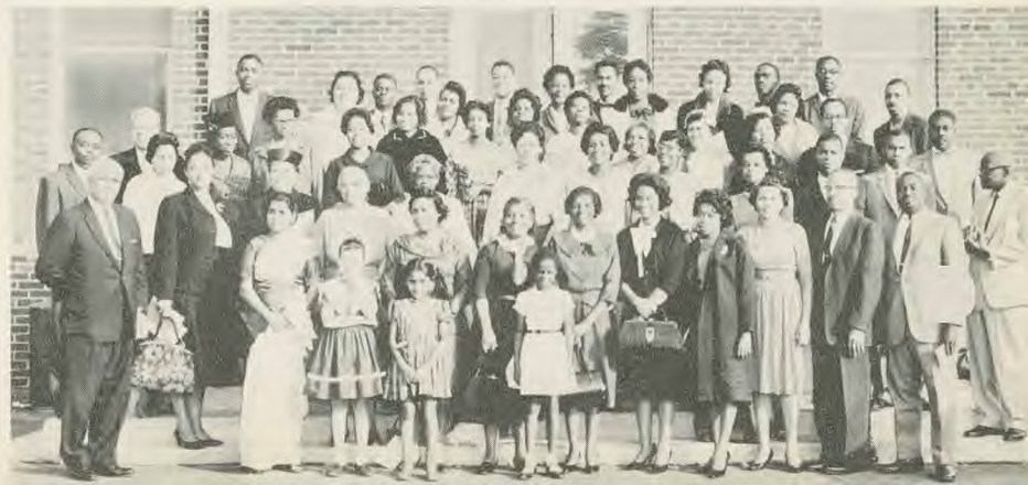
Group of Allegheny conference teachers and ministers attending the union-wide teachers' convention in Takoma Park, Washington, D.C.