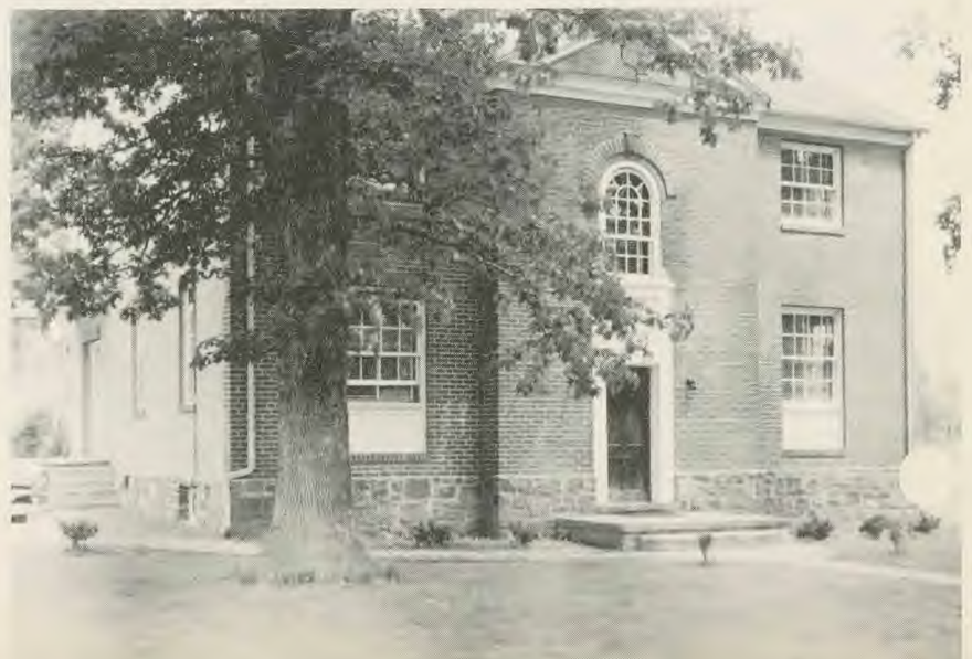
Allegheny conference office at Pine Forge, Pennsylvania.