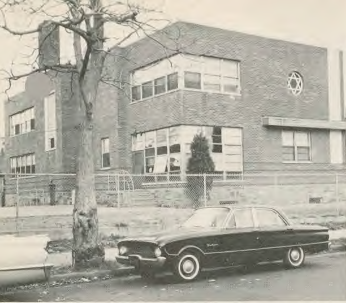
Larchwood school, 6007 Larchwood Avenue, in South Philadelphia.