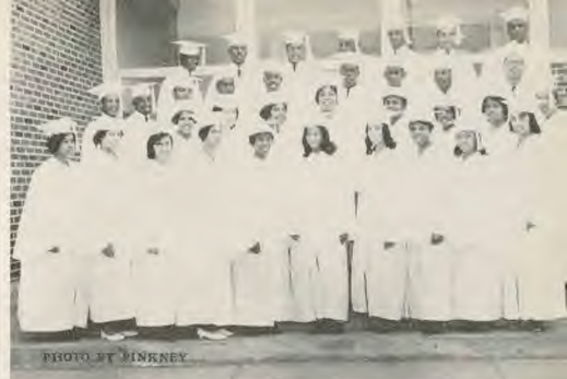
Many of these students sold books during the summer months. The group shown here formed the largest graduating class in the history of Pine Forge Institute. Photo was taken in June, 1961.