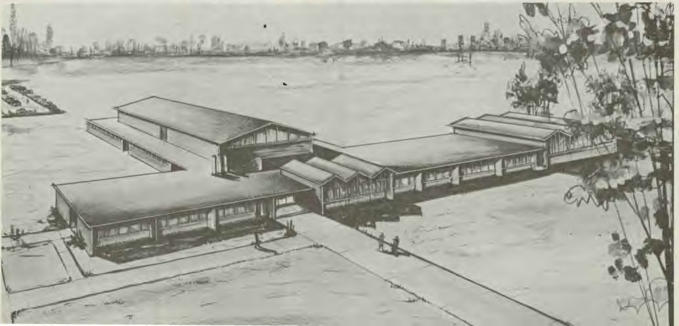
Proposed school plant—City Temple and Sharon Seventh-day Adventist churches.

The educational work around the conference has taken on new dimensions. The Davison Avenue school in Detroit, Michigan, is showing much improvement. A large enrollment in