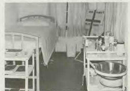
View of first-aid room provided by medical missionary nurses corps of the Ephesus church at Wilmington, North Carolina. This corps has 27 members, all of whom have taken the home nursing course of the American Red Cross.

HIGHLIGHTS of reports at the biennial session of the South Atlantic Conference were the 1,953 baptized; the fact that the conference led North America in baptisms in 1963; the 139 branch Sabbath schools operated; the $240,000 worth of literature delivered, including $65,000 student sales; the enrollment of 1,500 boys and girls in the twenty church schools; the $933,039 tithe and $312,223 missions offerings; the new churches in Atlanta, Georgia; Miami, Florida; Greensboro