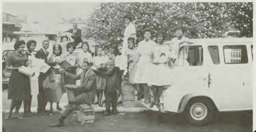
1964 Lake Region Conference student literature evangelists who found great joy in traveling from city to city, spreading our gospel literature. They have all signed to work again next summer.