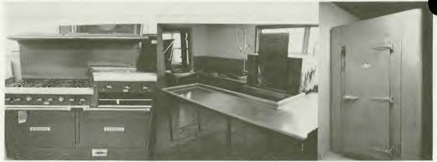
The above equipment at Victory Lake campground was purchased with proceeds from junior camp operations: new Vulcan stove with three ovens, Hobart electric dishwasher, and $1,500 walk-in deepfreeze.