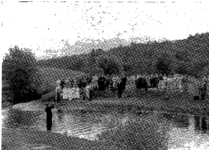
A "Jordan" in the Arctic Circle. Youth Camp near Narvik, North Norway.

Never have our colleges been filled with more promising and responsive youth than we find this year in our schools. One hundred out of one hundred and fifty colporteurs in the field in Finland this summer were our young people from Toivonlinna College. One boy in his teens sold 112,000 Finnish marks' worth of orders in one week. Another lad sold 120,000 marks' worth in one week. That means that they