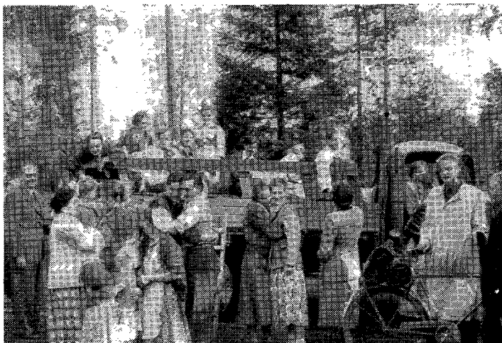
"Nekamen." A typical Finnish farewell at our Youth Camp at Mikkelei, Finland.

The MV Courses have taken a strong hold upon our youth in West Africa. It was my privilege to attend more Investiture services in two months in this country than I have done in a similar period during my whole experience. This is a splendid testimony to the vision and ser-