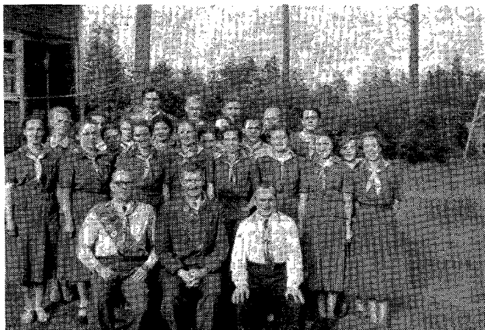
Catching the vision of youth leadership. MV Officers' Camp in Finland, 1952.