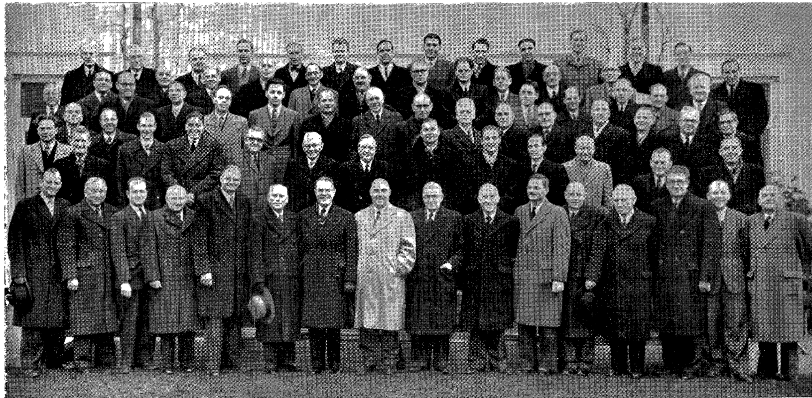
DELEGATES IN ATTENDANCE AT THE BIENNIAL COUNCIL.

Held at Skodsborg, Denmark, December 11th to 18th, 1952