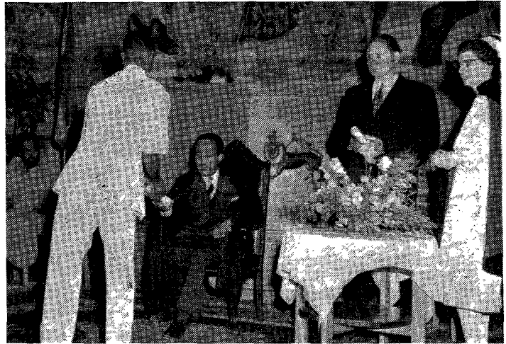
His Imperial Highness, the Crown Prince, presented the diplomas.