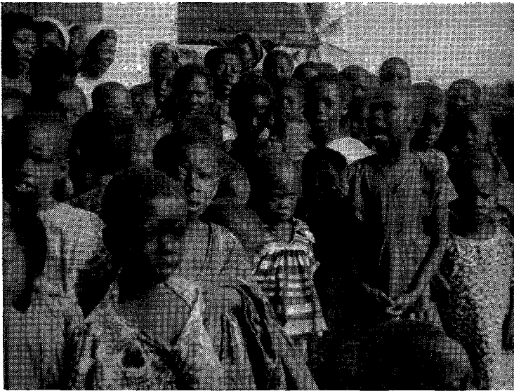
One of the 115 Branch Sabbath Schools conducted by our youth in West Africa.

drinking unboiled or unfiltered water, I shall wait until I get to the car, another five miles ahead, where I shall quench my thirst, if quench it I can with that tepid water that is awaiting me. It will keep me going until I get home to-night, however, where I shall get a good cold drink from the refrigerator.