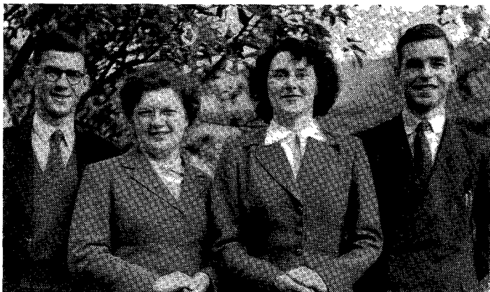
Committee of the Adventist Students' Association of 1953.