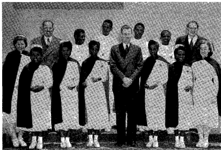
Ready for the call of the Great Physician.