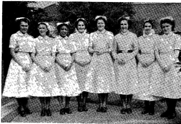
A few of the thirty-five Adventist nurses from our Division and Europe in training at hospitals in Watford, Herts., England.