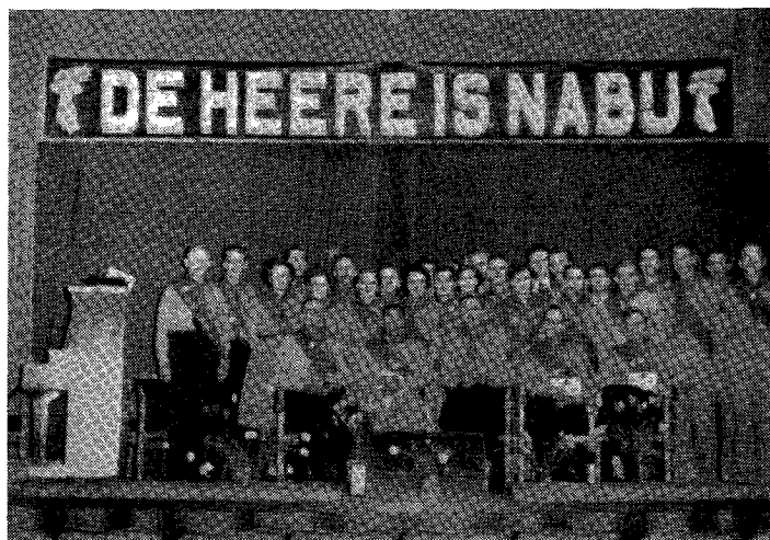
The Motto: "The Lord is at hand."

Opportunities for becoming personally acquainted with our youth, of helping them to know God's plan for them, are numerous. Through the Morning Watch Circle, Prayer bands, Bible study, discussion periods, recreational activities, and fellowship with the youth in God's great out-of-doors, may we, under God's blessing, make this coming season the greatest in our history in soul-winning accomplishment. May our camps be real evangelistic centres where our youth are not only won to Christ, but also led into a greater and more glorious Share Your Faith Crusade.