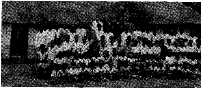
Pupils of the S. D. A. Mission School at Yele, in front of the old school building. It has served for many years—has been rebuilt, patched and rethatched many times, but is now superseded by . . .

"In the design of this new style structure the mission has created a precedent for, not merely contemporary style, but for the ultra modern. For here is a school property erected by up-to-date methods of construction and incorporating big improvements in ventilation and lighting without glare. . . . The S.D.A. Mission has conducted a school in Yele for a period of forty years and now, with the tremendous impetus to education that is reflected in the larger enrolments, a new and more commodious building became necessary. These modern, clean-looking buildings are certainly more attractive,