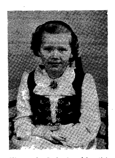
The little Icelandic Adventist girl who was chosen to present a bouquet to the president's wife.

bishop in which he expressed his thanks and wished us the blessing of God on our work.