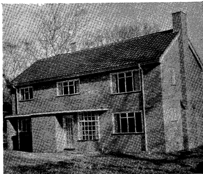
The Principal's Home, Newbold Missionary College.

in joint council, and after making some modifications in the tentative agreement, unanimously voted for the plan. This agreement was later critically studied by the faculty of Washington Missionary College, as it was also by the officers and available members of the Northern European Division committee, and was finally taken to the General Conference committee, where it was approved in