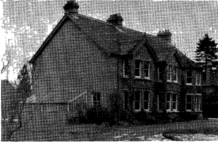
"Crossways" — a new residence housing, at present, six married couples and their children.

early May. The status of the plan was announced at graduation and I am happy to tell you that five three-year graduates (two of the current year and three of former years) who were definitely planning to go to America are with us at the College this year. You may be surprised to learn that we anticipate eight degree graduates at the close of this school year. As we go along into the future the affiliation with Washington Missionary College should bring a good deal of stability into the school planning of our young people. The fact that they can complete the four-year programme at Newbold and then for graduate work have the assurance that they may enter our own seminary or other American colleges without penalty or handicap will bring a feeling of security in their educational plans.