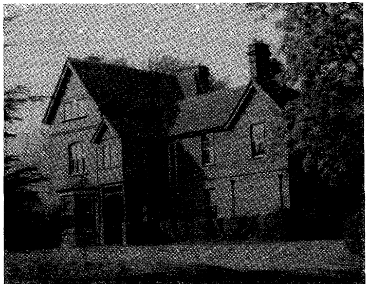
"Parkham" — another fine residence for faculty and students.

While considerable patience has necessarily been developed during this waiting period we also feel that refinements have been made in the plans, so that we believe when the building is completed it will be very satisfactory and a joy to