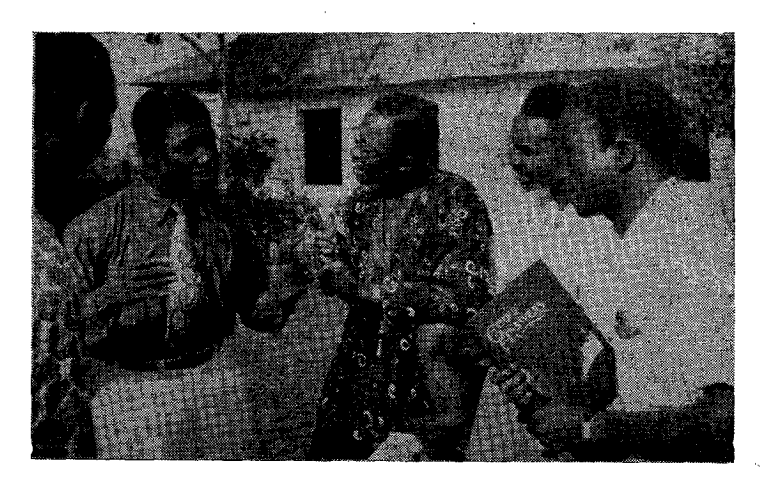
Colporteur Evangelists in action in West Airica. Is he really interested?

its fulfilment today in many parts of our far-flung Division territory.