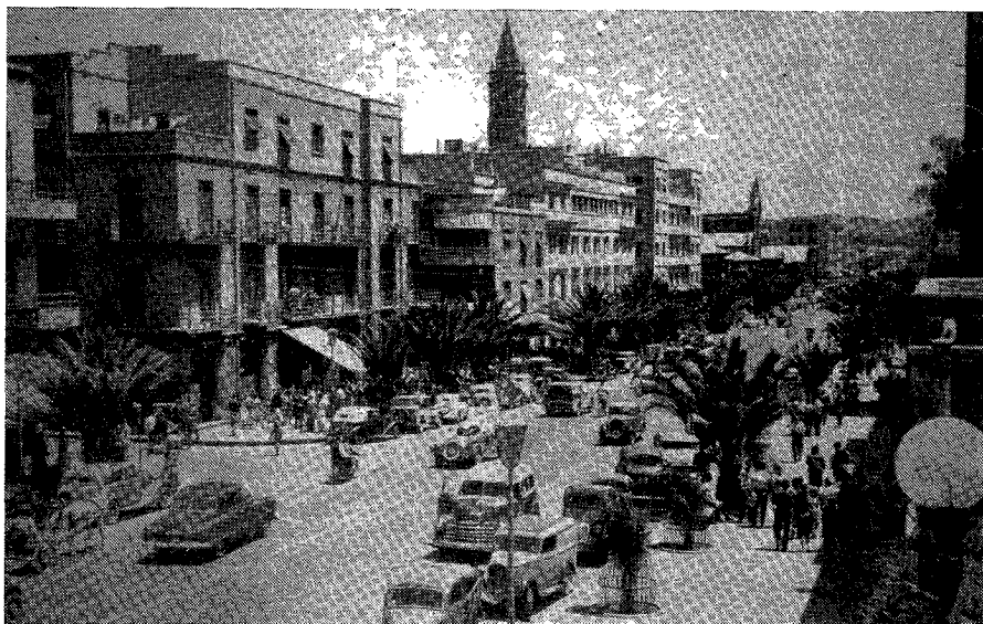
The modern city of Asmara in the Eritrea-Tigre Mission looking down Avenue Haile Selassie.

formed. Next came a letter from him asking us as to the amount we would need to get this equipment. It was felt that $12,000 (US) would be adequate, and he was again informed. We must say that our faith was not strong as we just could not see this man sending us that large amount. We knew, however, that the Bible says that nothing is impossible for God to do. Two weeks later a letter arrived with bank drafts totalling $15,000 (US). This was three thousand more than we had asked for. Does God open ways for furthering His cause? Our hearts were saddened when two weeks later we received a letter that our good doctor