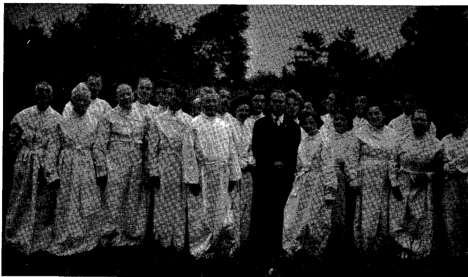
A rich harvest of souls is being gathered in Poland. Above is a baptism of twenty-two persons in the city of Katowice. Another twenty are preparing for the next baptism.

Everywhere our churchmembers in Poland are of good courage. Again we had a most cordial interview with the Vice-Director of Religions, and were