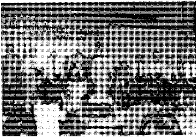
Ten outstanding laymen who were awarded

One of the final actions taken by the Congress was to recommend that the Second NSD Lay Congress be held in the year 2000 in China.