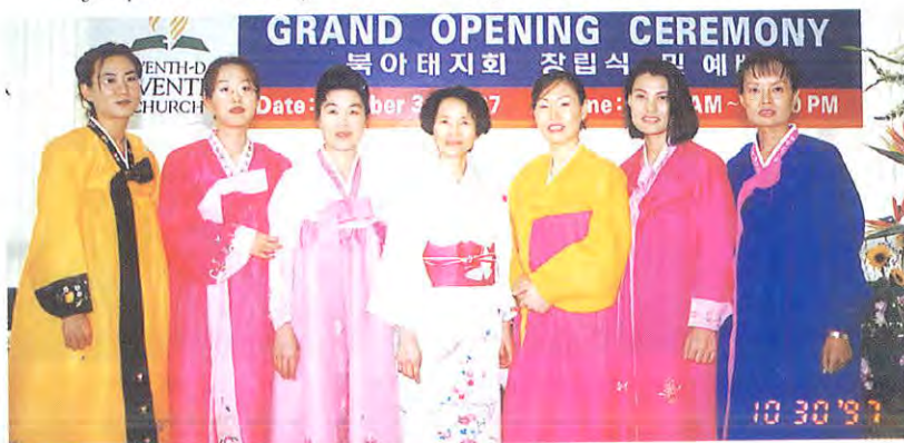
Ladies dressed in their national costume welcomed participants for the program.

People of Hope Seventh-day Adventists will communicate Hope by focusing on the quality of life that is complete in Christ.