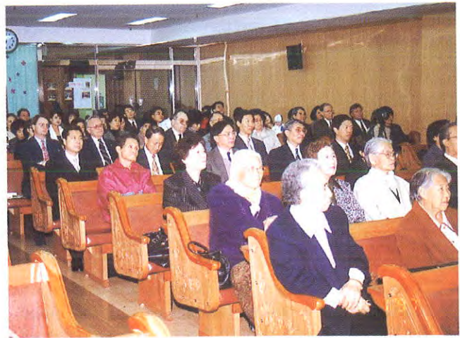
The delegates of the NSD Annual Council joined the Ilsan Church on Sabbath November 1, 1997.