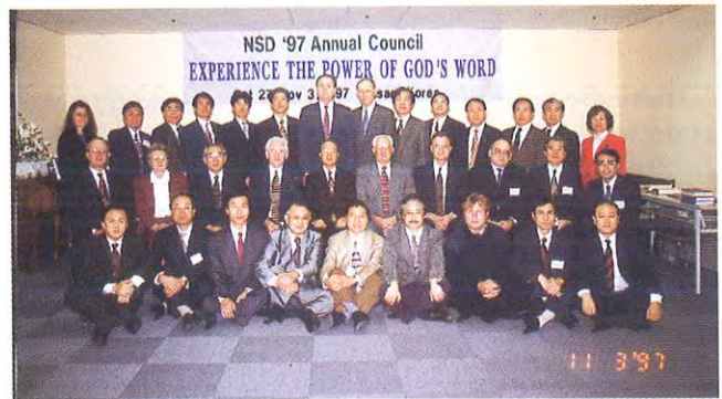
The delegates who participated in the NSD Annual Council.