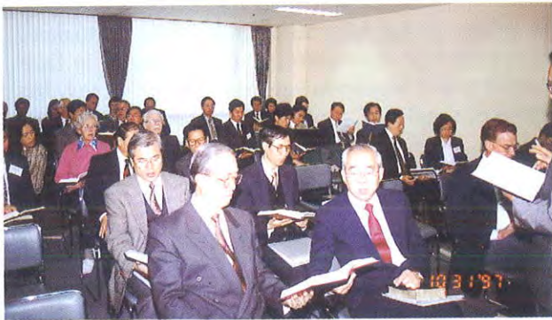
Attendees who are singing a church hymn during a song service.