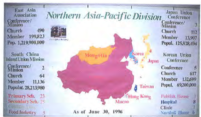
A big map of the NSD territory which shows the growth of our church in the evangelistic, educational, medical work and etc.