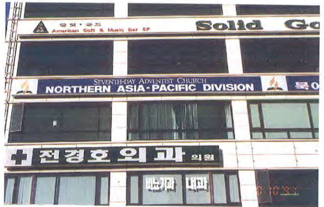
The NSD Annual Council was held at the fifth floor of Sam Hee Plaza near by Chuyop Subway Station, Ilsan in Korea.