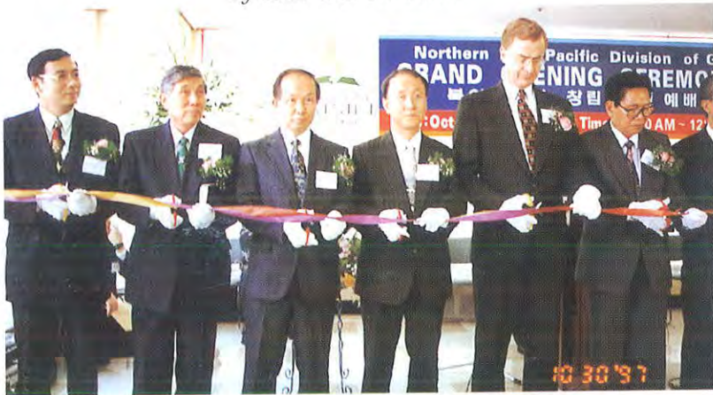
The ribbon cutting ceremony was conducted by representatives of distinctive organizations in our church.