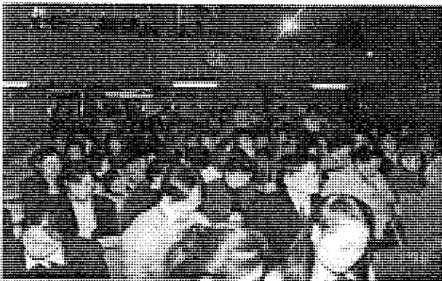
Participants filling the meeting place, Seoul Eastern Church.