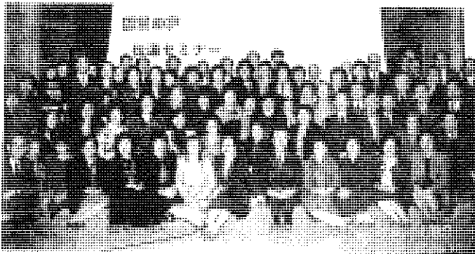
The participants of the VOP Evangelism Seminar in Okinawa on January 29, 2000.

Shinmyo spoke of "Efficacy of the BCS," "The BCS for ACTS 2000" and "The Current Trend of the BCS." He used video tapes and computerized presentations in his lectures. It was emphasized that each local church could be a branch of the BCS and that as a result the church would be revived in evangelism. It was also stressed that ACTS 2000 would be a great opportunity to establish a branch BCS at a local church; a congregation could utilize it as an effective method to prepare baptismal candidates, since ACTS 2000 would be a harvest evangelistic campaign.