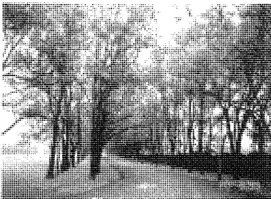
Beautiful Taiwan Adventist College Campus