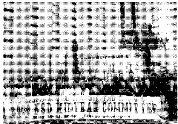
The participants in front of the hotel

The business session could vote all prepared agenda within the scheduled dates. Among 40 actions half of them were the policy amendments. Some of the significant actions were "Tithe sharing - Contribution Percentage Revision" and "Tithe sharing - Adjustment." This was due to the situation of the North American Division. Those actions say, "Divisions other than the North American Division will increase their tithe percentage contributions in and equal amount from 1% to 2% over a five-year period, ..." "The North American Division will decrease its tithe percentage from 10.72% to 8% over a five-year period, ..." and "That the additional tithe percentage to be sent to the General Conference, starting January 1, 2001, be provided from the NSD and not be passed on to the unions."