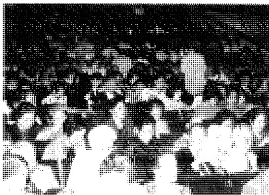
The attendants of the 50th Anniversary

The Okinawa Mission celebrated the 50th Anniversary of the church work in the islands on May 13 (Sabbath), 2000 at the Ginowan City Hall. Since this special program was scheduled right after the Northern Asia-Pacific Division (NSD) Midyear Committee, many delegates of the committee could attend the services on the Sabbath. In other words, this event might be one of the reasons why the NSD Midyear Committee was conducted in Okinawa. Okinawa is composed of many islands and belongs to a semitropical zone. Its beautiful coral beach is well known and attracts tourists more than 3 million annually. Therefore, overseas participants appreciated so much that they could step foot in this land once prospered as the Ryukyu Kingdom.