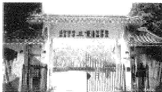
Entrance Gate of Taiwan Adventist Academy and College

The suspense of not knowing the results of the hearing