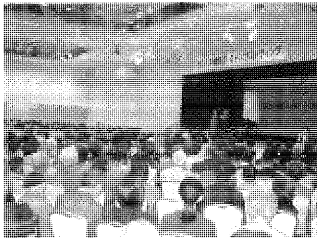
Arround 800 attended at the Sabbath programs on February 16, 2002 in Okinawa, Japan.

As God's people in these last days, we too encounter many big and small Jordan Rivers that prevent us from entering the Heavenly Canaan. We need miracles from God in order to live good Christian lives and to accomplish the gospel commission. God will surely perform miracles for His people when we move forward by faith. When we see the signs of the times being fulfilled in the world, we can be sure that Jesus is coming soon. Let us prepare to meet Him who will soon appear in the clouds of heaven.