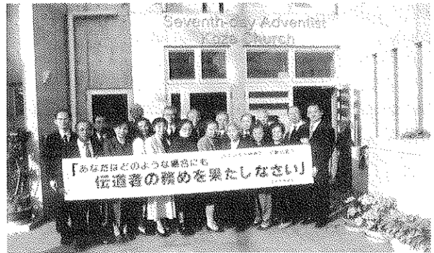
The participants of the Okinawa Mission Literature Evangelist Rally

among them were 5 credential LEs (over 1,680 working hours), 8 licensed (over 1,440), 1 full time (over 1,440), 138 part timers (over 200), and lay (under 200) 121.