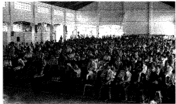
Participants in the 10th Anniversary Ceremony of 1000 MM at the Gym of 1000 MM Headquarters

had become more and more powerful in glorifying God's name. Ten years later, pastors and missionaries gathered to worship the Lord with thanksgiving for His guidance. More than 2,700 missionaries from 44 different countries have dedicated their lives to the Lord for one year as 1000 Missionary. They have baptized about 27,000 members and built hundreds of churches bringing new congregations every