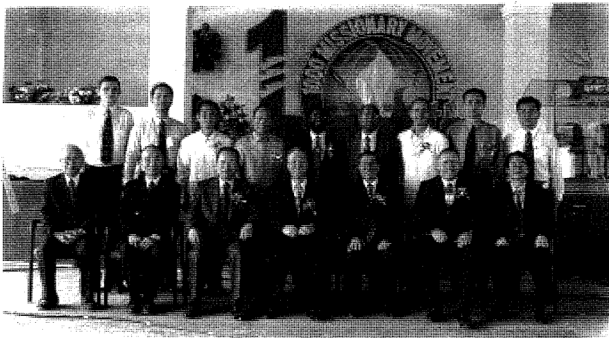
Leaders from the GC, NSD, SSD, CHUM, JUC, and KUC

Now it is time to prepare another take-off since we thank God for His 10-year guidance of this movement and rejoice in praising Him. We need to map out an extensive scheme of this movement to send 1000 missionaries every year as the name says literally. Preparatory Missionary Movement may