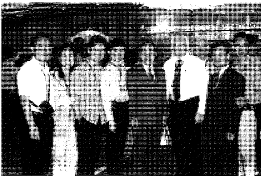
Auditors in the NSD Territory with GCAS Director and Guest Speaker

Previously, GCAS had separate seminars for each division area. But this one was a very meaningful one, since it was the first worldwide auditors' seminar.