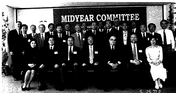
The Members of the NSD Midyear Committee

3. To approve in concept the establishment of a Geoscience Research Institute, NSD Branch.