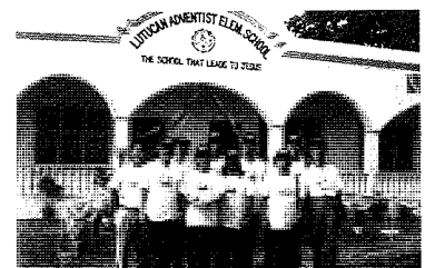
Ten Japanese Volunteers and Lutucan Adventist Elementary School

The Japanese were also delighted to participate in the project. They said, "We wish to do another project. We are glad to make new friends. And we are thankful that we are able to help God's work." They are looking forward to the next project.