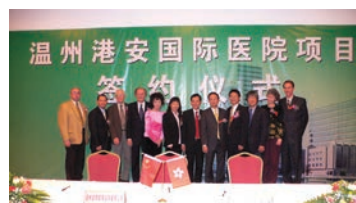
China Hospital Page 5