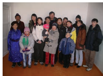
Mongolian Baptism Page 2