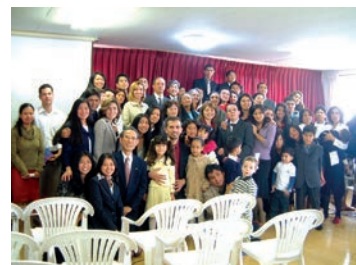
Brazilian Church Page 3