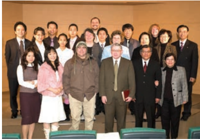
Group that met for the first Sabbath worship in the NSD Church planting project

Korea exemplifies the high demand for English through Language Centers due to the challenge of the international community and world globalization. Many students from SDA Language Institutes are exposed to the beliefs and life style of the Adventist Church.