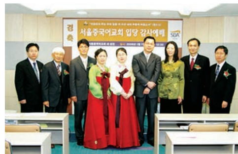
Chinese language Church Planting

Since May 2000, a group of Chinese language school teachers and students have been worshipping the Lord in a class room every Sabbath. Recently the East Central Korean Conference approved the status of the Chinese language school church as a company, effective January 7, 2006.