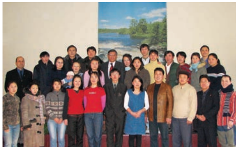
Mongolian Church leaders who attended the training session