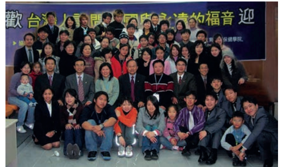
PMM Church Planters using tour as evangelistic tool