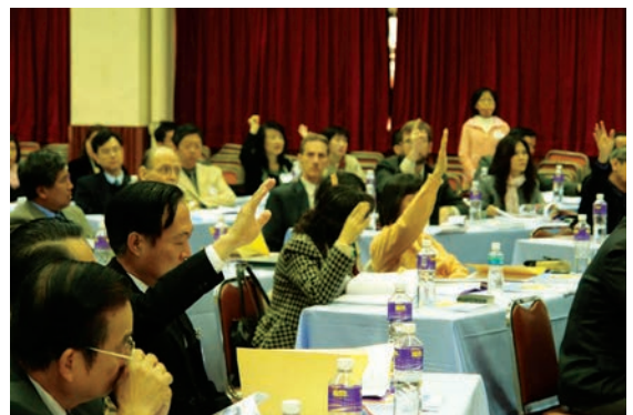
Delegates to CHUM session