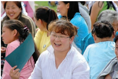
Happy People at the Happy Plus Camp