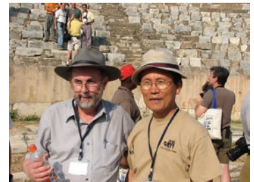
Bible Conference Page 3