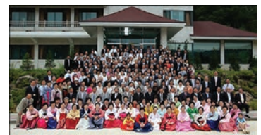
KUC LE’s 100 years Page 6