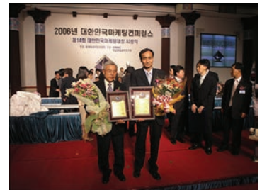
Accolades Page 2