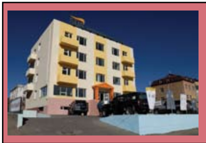
Language School, page 7