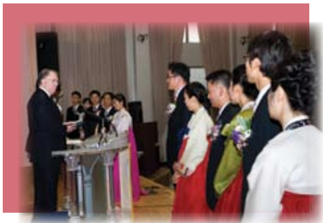
PMM Dedication, page 12