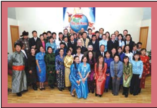
Paulsen Visit to NSD, page 8