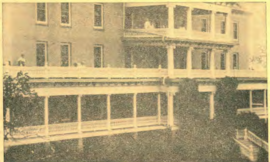
The patients at the Nevada Sanitarium find well-trained physicians and nurses to care for them. The institution offers efficient service to its patients.

Take one for yourself, and one or two for your relatives and friends. Use the special offer order blank to the left below, and order through your own Book and Bible House. If you have never seen a copy of Health , drop a postal card to the Pacific Press, Mountain View, California, and a free copy will be sent to you.