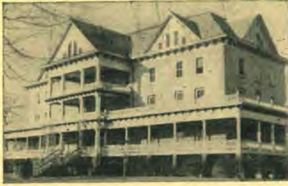
Iowa Sanitarium and Hospital "The Health Center"

over the top include: Hawkeye, the first church to reach its super-goal; Muscatine, the first church to raise the base goal; Audubon, who have reached their super-goal, and Sidney, which was not only the first company to reach its super-goal, but even preceded the churches in reaching its goal. There has been reported $3600 from the field. Iowa was one of the first conferences in North America last year to reach its base goal. Every one in attendance at the camp meeting was anxious to put over the Harvest Ingathering this year in record time. The Educational Department desires that the church schools immediately launch out. The Missionary Volunteers societies too are called into action. Singing bands should organize at once. Let us press the battle on every front. Now is the time to work, before the local community drives and various relief campaigns get under way. Now we can work to the best advantage. Iowa is noted for its tall corn. We have a tall corn bulletin device. Watch Iowa's $13,000 Harvest Ingathering tall cornstalk grow!