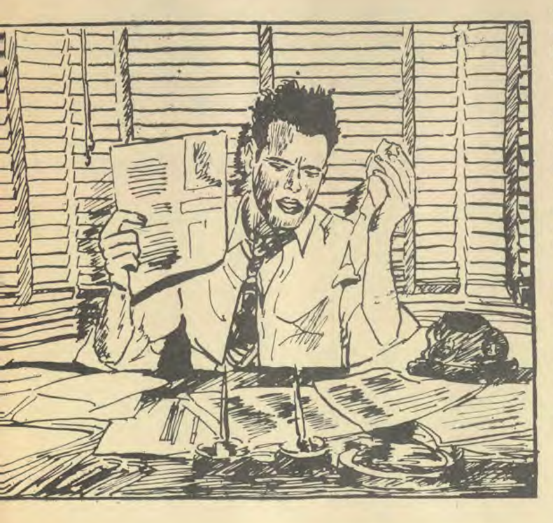
In facing your day to day work, avoid worry and claim the promise of divine help so well portrayed in the Scriptures; "Be still and know that I am God."

"Why all this bally-hoo about nothing?" he demanded gruffly. "I think this play is downright stupid, and you girls are silly for going to all this trouble to get ready for it!" So saying, he swept his arm through some of the gayly floating streamers, pulling them to the floor. Then, without a backward glance, he bolted through the door, banging it behind him.