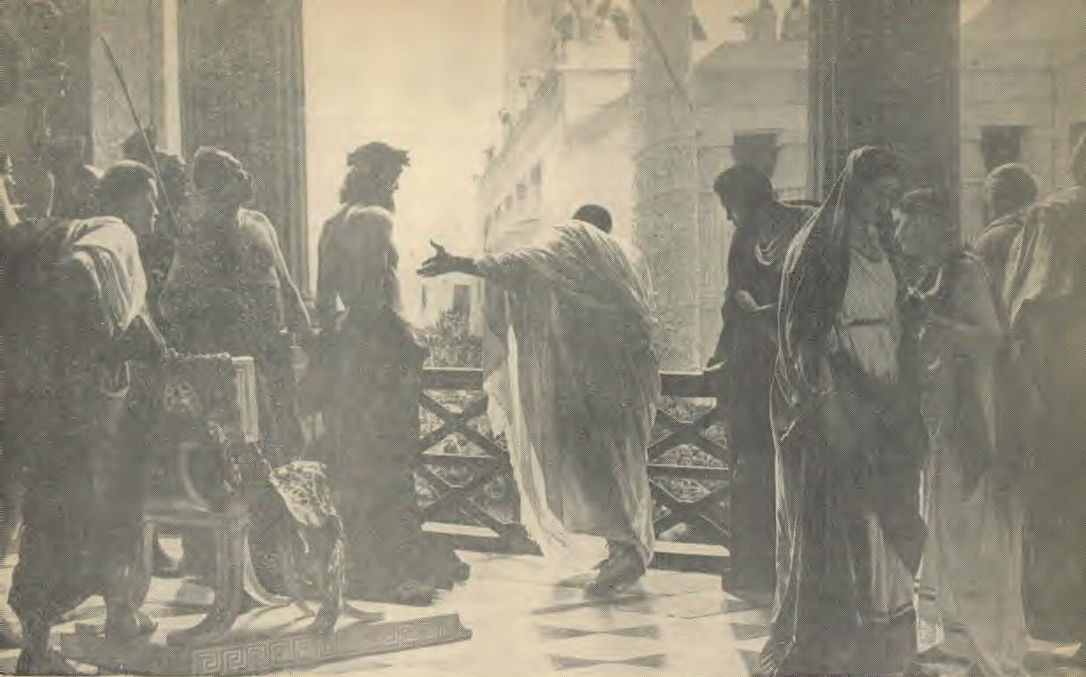
A. Ciseri, artist

was born, this is why I came into the world, to bear testimony to the truth. Everyone who belongs to the truth listens to my voice" (verse 37, Moffatt). Pilate said "What is truth?" but did not wait to hear Christ's reply.