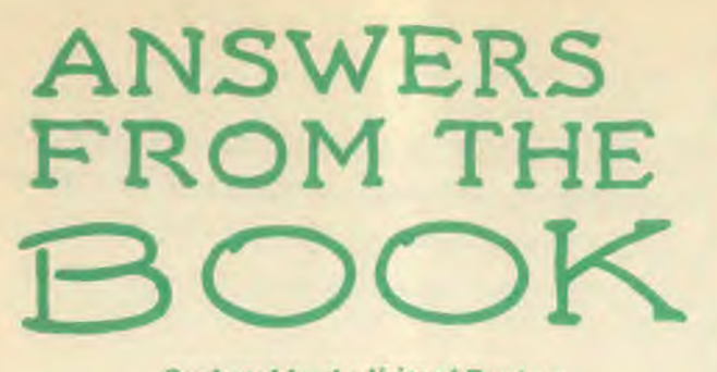
Conducted by the Voice of Prophecy