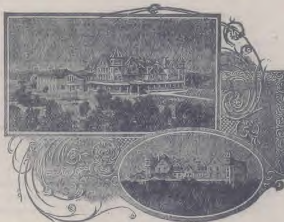
OUR SOCIETY'S SANITARIUM IN SOUTH AFRICA.

We enter upon the new volume by faith, and not by sight. The unsettled condition of the country makes it exceedingly difficult to carry on our paper with any degree of satisfaction. Doubtless some