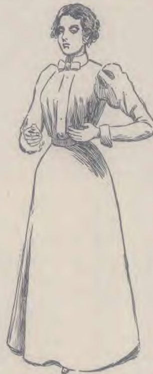
Illustrating Breathing Exercise.

Another important principle consists in maintaining the proper position of the body when walking, standing, or sitting. Many