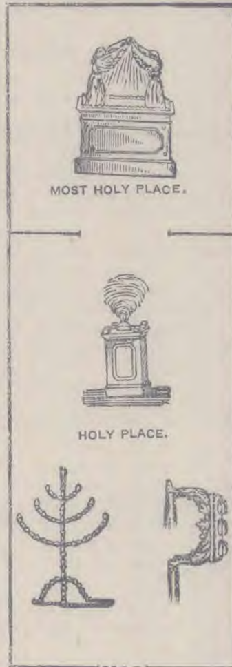
GROUND PLAN OF THE EARTHLY SANCTUARY.

THE reader to whom these views are new will be ready here to inquire perhaps, with some astonishment, what this strange work could possibly be designed to typify. We answer a similar work in the ministration of Christ, as Paul clearly teaches. After stating, in Hebrews viii., that Christ is the minister of the true tabernacle, the sanctuary in heaven, he states that the priests on earth served unto the example and shadow of heavenly things. In other words, the work of the earthly priests was a shadow, an example, a correct representation, so far as it could be carried out by mortals, of the ministration of Christ above. There is therefore a work performed by Christ in His ministry in the heavenly temple, corresponding to that performed by the priests in both apartments of the earthly building. But the work in the second apartment, or most holy place, was a special work to close the yearly round of service, and cleanse the sanctuary. Hence the second phase of Christ's ministration in the heavenly sanctuary must be a work of like nature, and constitute the close of the work as our