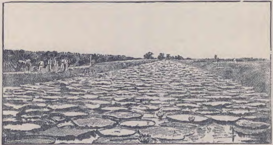
VICTORIA REGIA, GROWING IN A CANAL.