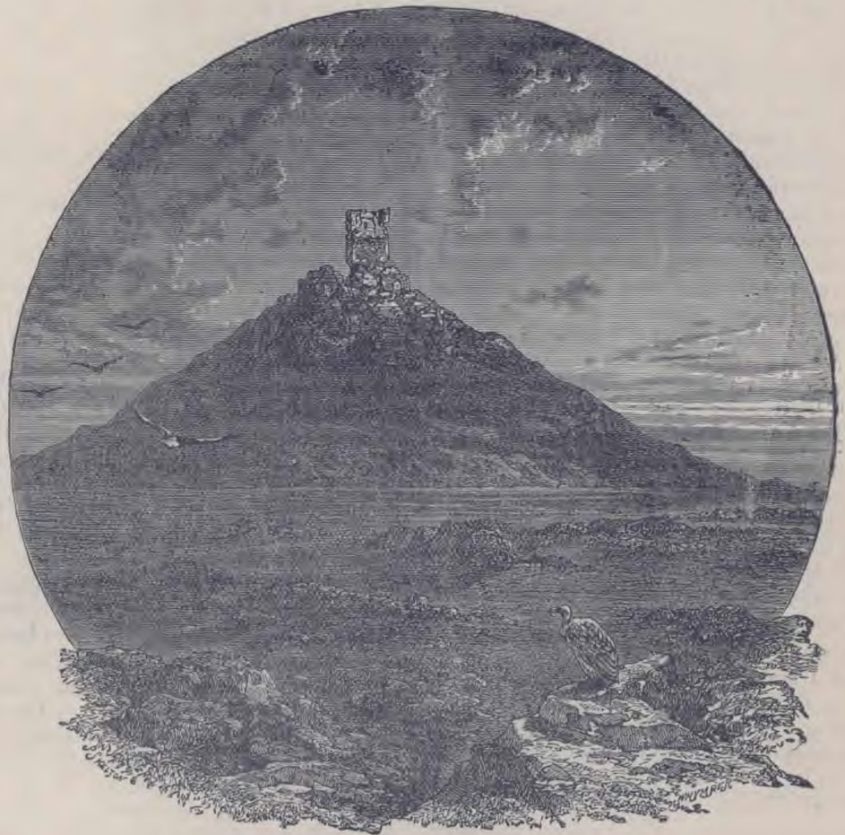
RUINS OF NINEVEH.

sent to Nineveh to speak the words of the Lord, and warn Assyria of the wickedness which was growing with its pride and luxury. And the Lord was no respector of persons in condemning wickedness, for in those same days He had been sending prophets to Israel calling them to repent of their wicked ways, and to cast away the