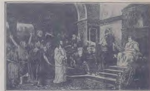
A Beautiful Engraving (18 by 12 inches). MUNKACSY'S "CHRIST BEFORE PILATE."

THE opening of the new century, Lord Rosebery predicts, will witness the fiercest of international rivalry in the arts of war and commercial industry.