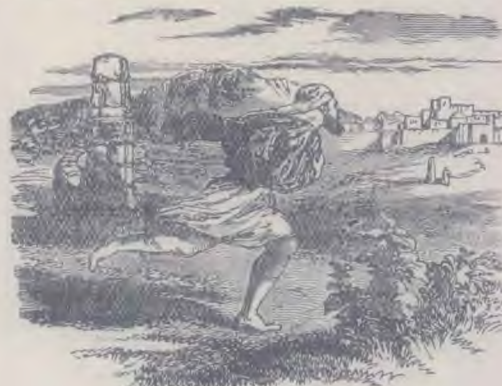
THE CITY OF REFUGE.

GOD appointed six cities belonging to the priests of the Levites to be places of refuge. These cities were of easy access, situated on mountains or in large plains. That no-