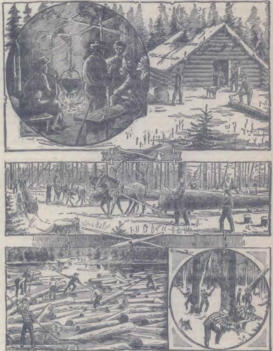
IN THE AMERICAN TIMBER REGIONS.

WHILE February's sun reminds us, here in India, that winter is past, and the warm season is at hand, in Northern Europe and America the month is very likely a cold and frosty one. In the forests of Canada and the United States, the "lumbermen,"