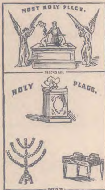
Service in the Holy Place.

ment, "it follows that the original law is in the original ark. The "holiest" in the earthly contained the two cherubims, and the presence of God was manifested between them above the mercy seat. Ex. 25: 22: "And there will I meet with thee, and I will commune with thee from above the mercy seat, from between the two cherubims." We learn from Ps. 80: 1, that God dwells between the cherubims: "Thou that dwellest between the cherubims, shine forth." The golden censer was also seen in heaven. Rev. 8: 3: "And another angel came and stood at the altar, having a golden censer; and there was given unto him much incense, that he should offer it with the prayers of all saints upon the golden altar which was before the throne."