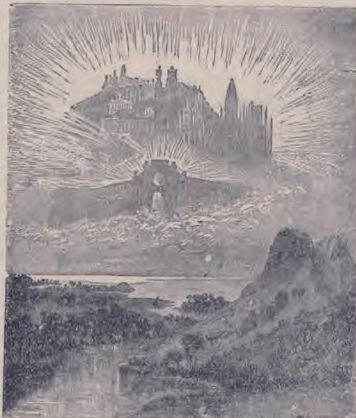
Not from above, but from beneath.

It is equally evident from experiments that the individual under the hypnotic spell of another, remains in this one's power until he voluntarily surrenders control. There is that much of truth in the "uniformity" plea. What is not true is the claim that this latter class of persons do not manifest the same powers and subjective states as the self-entranced mediums