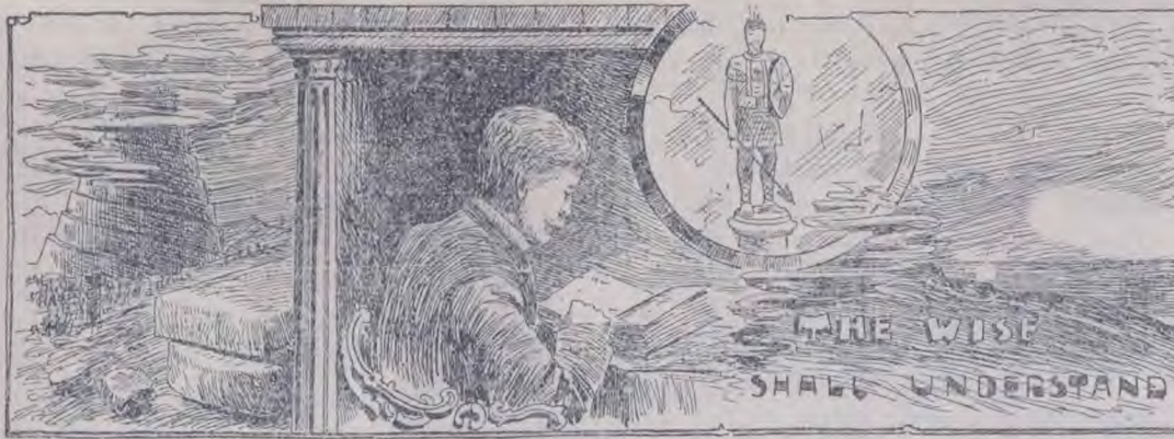
THE VISION OF DANIEL EIGHT.

The symbols of this chapter are mostly explained in the chapter itself. The ram with two horns, the higher of which came up last, represented the kings, or the kingdoms of Media and Persia, the two horns symbolising the two elements in the nation, the Medes and Persians. The Persian came up last and attained the controlling influence. Hostilities first broke out between the Babylonians and the Medes, whereupon Cyaxeres, king of the Medes, summoned to his aid his nephew Cyrus, the son of his sister who had been married to Cambyses, the king of Persia. Cyrus responding with an army of 30,000 Persians was at once