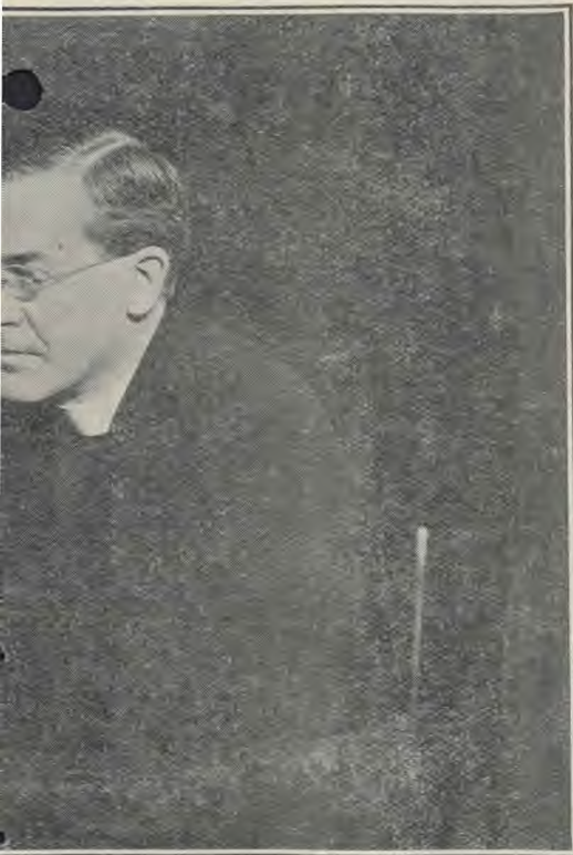
The "Free" Catholic Movement in England.

as clear as day that the Free Catholic to familiarise the Protestant denomina- y, little by little, to break down their to papal rule.