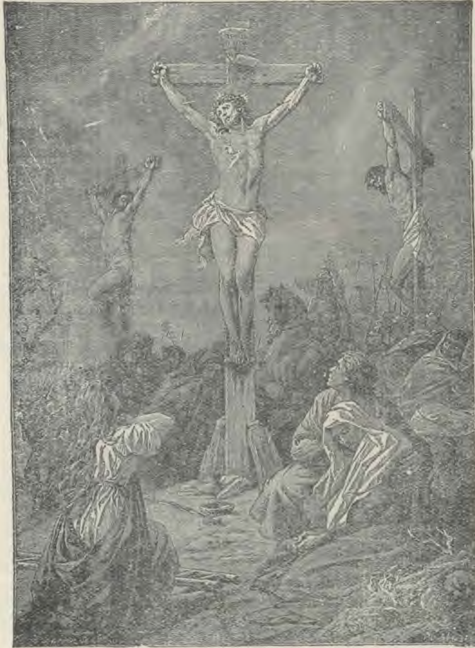
He Died for the Sins of the Whole World

For centuries before Christ came into the world to die for the sins of the world, the truth that His death was to be a substitutionary death was taught to the people of God. From the very