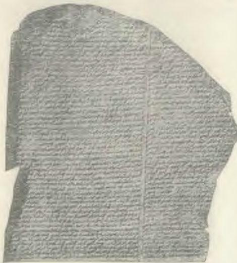
A Baked Clay Tablet Containing a Babylonian Account of the Flood

The Hittite nation, then, was not legendary. The Biblical references to that people have been confirmed by unimpeachable testimony. At one time they possessed an imperial greatness. These discoveries, coming at a time when infidelity is rife, are not chance happenings. The Divine Hand, which shapes events for the onward march of Truth, is in control of these modern movements to explore Bible lands. Archaeologists have been led into these interesting countries with a far-reaching object. The (Continued on page 24)