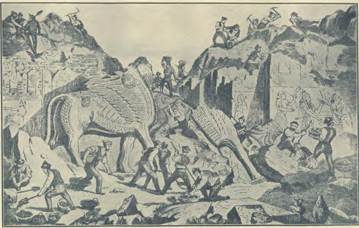
Archaeologists Digging for Historical Evidences of the Ancient World

Shattering the Bulwarks of Decency — A Triumph of Archaeology — Points on Tropical Hygiene — Romanism in the Free Churches