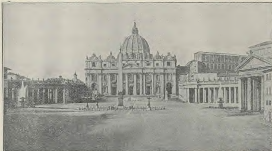
St. Peter's Cathedral and the Vatican Rome.

The chief meeting places of the Congress centred at two points—Soldiers' Field, one of