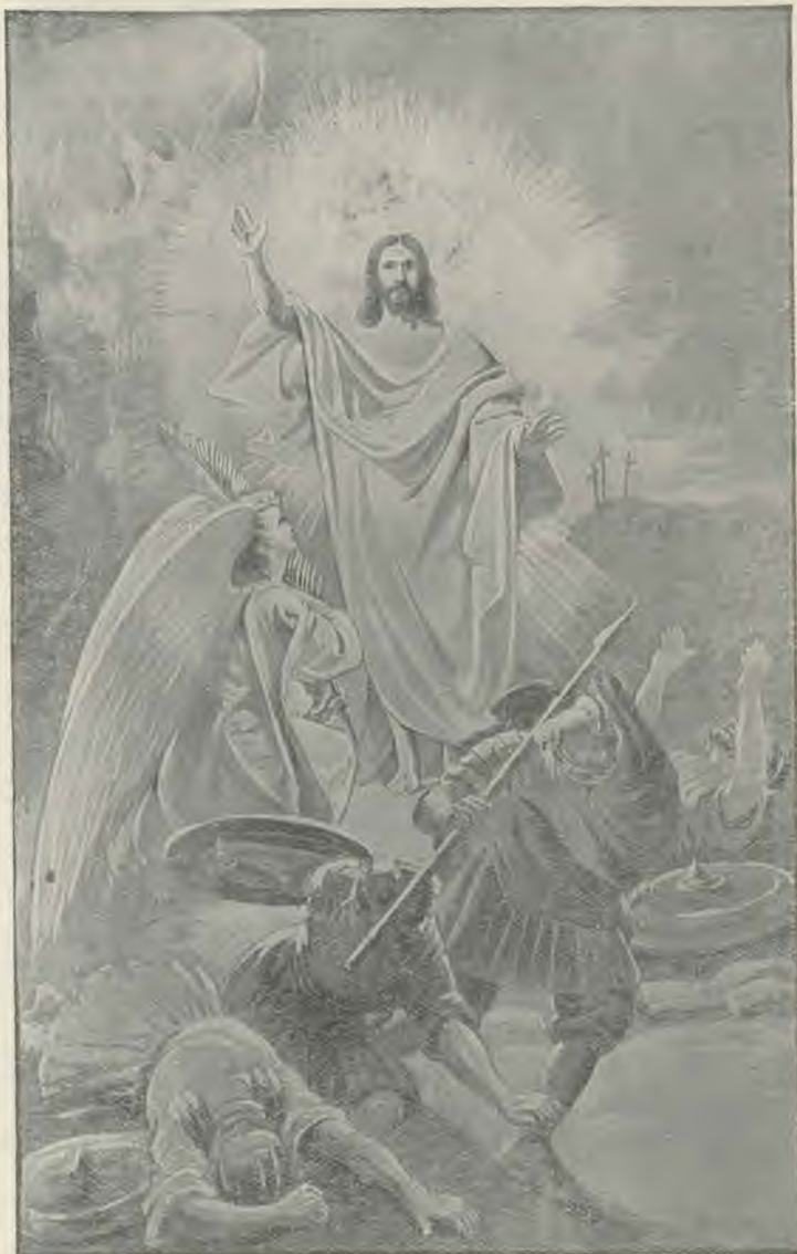
"He is risen from the dead; and behold He goeth before you into Galilee; there shall ye see Him: lo, I have told you."

Now if they lied, and these things were not true, and Jesus did not rise from the dead, then we are compelled to accept a miracle just about as great as His resurrection would be. These few despised Jews, without power or prestige, went into all the provinces of the Roman Empire, to men of other races and heathen religions and other languages, and persuaded them to believe this lie. Not by scores, or hundreds, or thousands, but literally by millions, and of all ranks, of both sexes, young and old, natives of the provinces and Roman citizens, even some in the