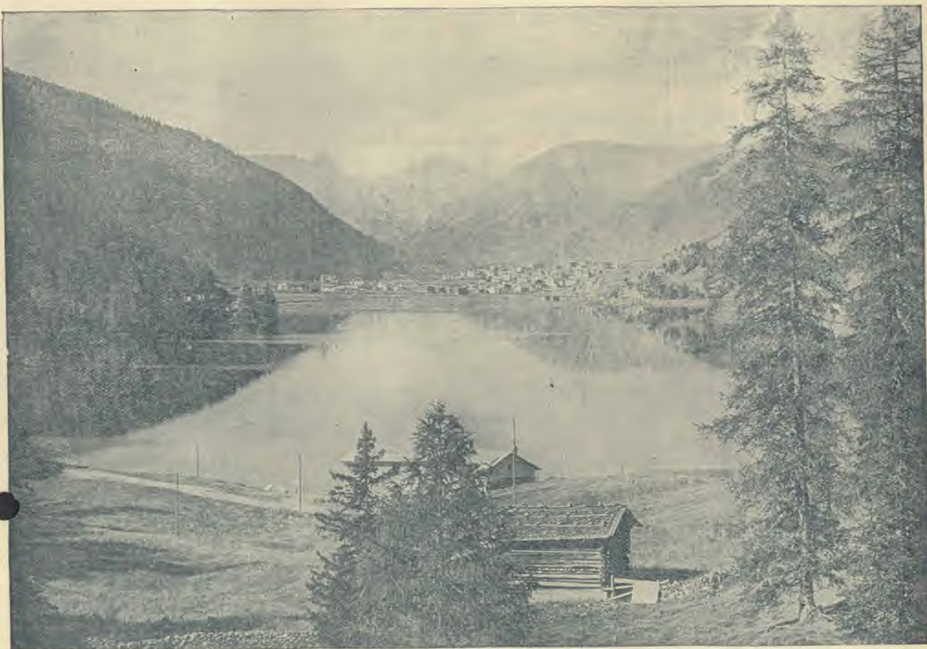
In Green Pastures And Beside Still Waters.

The Eucharistic Congress—What to Do for Snake Bite—Two Eloquent Events—Weakening of Our National Defence.