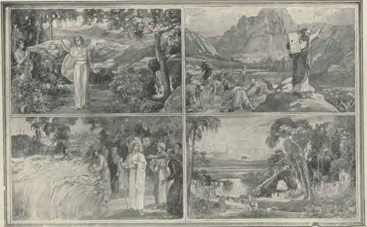
The Sabbath from Eden to Eden

"I have experienced some of this joy already, Pastor; and more than anything else in the