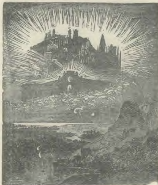
The New Jerusalem

Here, in this desolate earth, with its cities broken down and its whole expanse become a great wilderness, without any of the human race left, Satan will be compelled to stay for one thousand years. He is bound with a great chain. This chain is not a chain of iron or steel, or tungsten, or brass, but a chain of circumstances. He is unable to do anything. He cannot deceive the righteous, for they are in heaven, out of his reach. He cannot deceive the wicked, for they are all dead. There is nothing he can do. By the very circumstances of his position he is bound, and he must of necessity remain bound until some change is brought about either in the condition of the righteous or in that of the wicked.