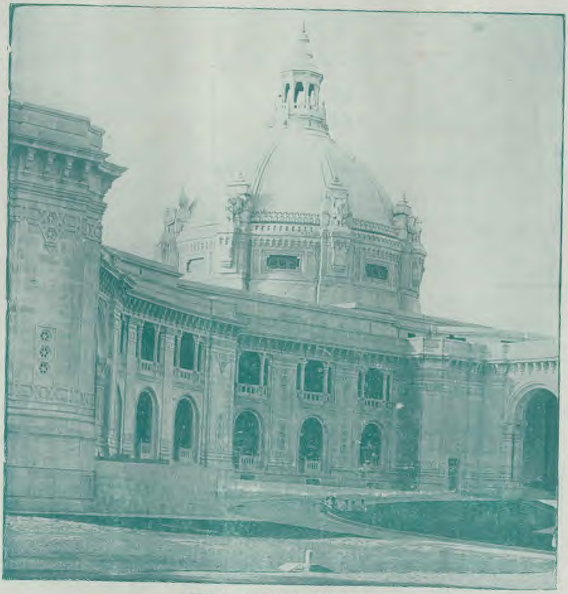
COUNCIL CHAMBER, LUCKNOW