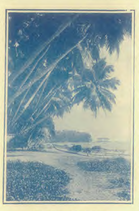
One of Nature's Beauty Spots

When I say that some one else is responsible for my sins, I am deceiving myself. Others may have placed temptation in my way, they may have urged me on; but the final decision was made only by the consent of my own will. In the day of reckoning all our excuses will vanish away. It will be found that our wrong-doing was of our own choice.