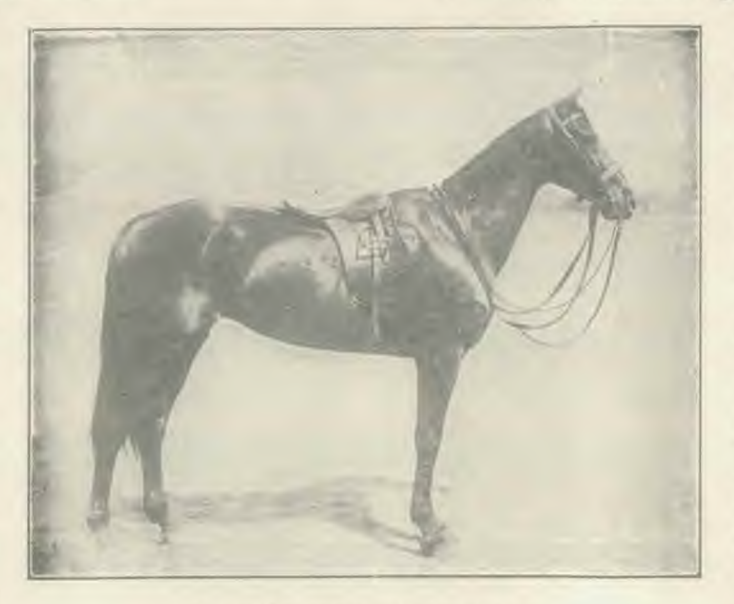
An intelligent animal and a friend of man

Pleiades, but their meaning must forever remain a closed book to him. Such ideas as time. space, abstract ideas, self-determination, are beyond the reach of the highest of created beings below man. John Burroughs rightly says in Ways of Nature": "Animal life parallels human life at many points, but it is on another plane. Something guides the lower animals, but it is not judgment; they are provident without prudence: they are active without