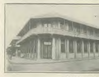
SOME OF O Washington, D. C., U. S. A. 2. 4. Shanghai, China. 5. Buenos U. S. A. 7. Cristobal, (