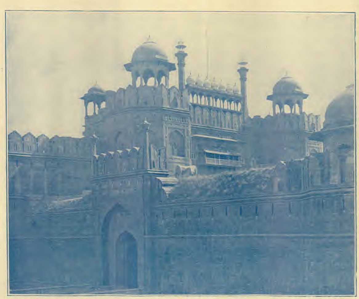
Indian State Railways