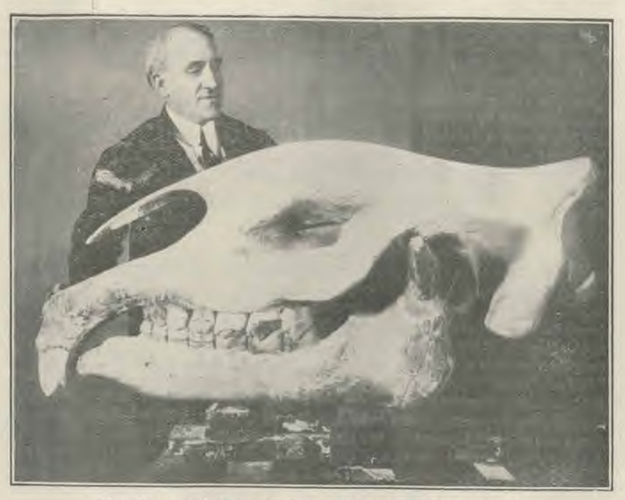
Skull Giant Baluchitherium, the Largest Mammal Skull Yet Discovered

But this rising-and-falling theory has been